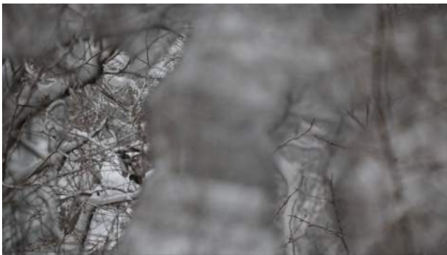
Figure 5: Two visitors collaborating to reveal the left edge of the piece while a third visitor towards the right is exploring the piece individually

Multiple visitors can collaborate to reveal a larger portion of the audiovisual scene at a given time. An example of this with three visitors can be seen in Fig 5.