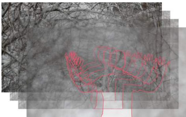
Figure 2: Four layers of Node Kara superimposed onto each other with a representation of the visitor's depth image highlighted

A virtual representation of the visitor is cast in the scene as a lens that articulates various depth layers of the visuals as seen in Fig 2. The real-time visual processing is achieved using a software developed with the C++ multimedia toolkit openFrameworks 1 . A custom OpenGL fragment shader utilizes the depth image from a Kinect sensor as a mask to cast various layers of video on top of the steady-state image based on the visitor's proximity to the sensor, which is positioned beneath the projection screen. This effectively creates the illusion of the work deblurring gradually in the visitor's image.