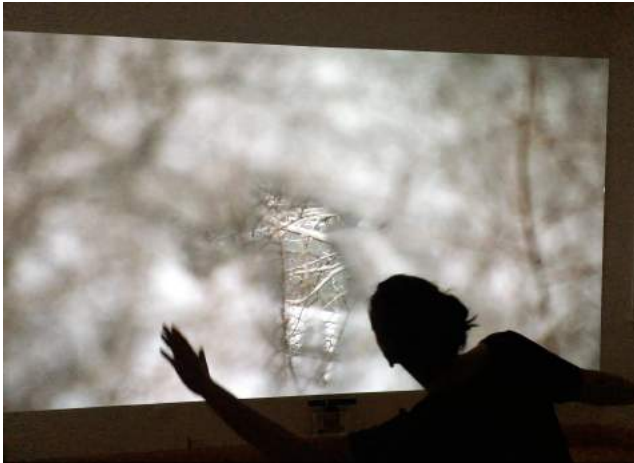
Figure 4: A visitor interacting with Node Kara

Although the visual component of Node Kara is displayed on a 2D display, the visitor's 3D interaction with the visuals, and the addition of interactive sound amount to an immersive experience. A three dimensional depth image of the exhibition space informs Node Kara of its visitors. The more a visitor gets immersed in the work, the more layers of the scene become visible.