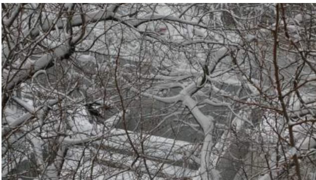
Figure 1: Wide depth-of-field image of the scenery used in Node Kara

Node and kara are two words in Japanese that indicate causality. While node is used to describe natural cause-and-effect relationships, kara is used when a causality is interpreted subjectively. Although a clear causal relationship between actions and reactions is a staple of interaction design, the user’s subjective experience of such relationships often trumps the designer’s predictions. By adopting blurring both as a theme, and a technique, Node Kara obfuscates the causal link between an interactive artwork and its audience. The deblurring of the audiovisual scene becomes an attracting force that invites the viewer to unravel the underlying clarity of Node Kara . This comes, however, at the cost of losing a broader perspective of the work as the viewer needs to come closer to both see and hear the work in greater detail.