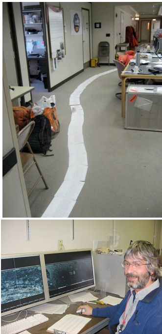
Figure 1. (Above) Hundreds of hand-drawn notes lying across the office. (Below) Scientist switched to use the CoreWall system to assist initial core description.