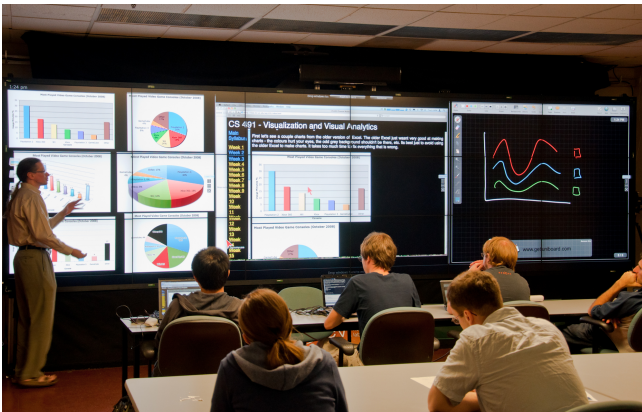
Figure 3. The high-resolution display wall used in the classroom environment.

The success of our design process and the application of wall displays in classrooms have extended beyond the visualization class. Currently several other computer science professors, and even an art professor, have adopted this environment for their classes and are benefiting from this technology.