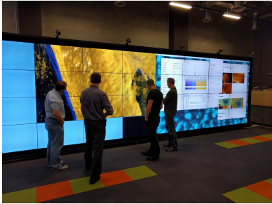
Figure 2. A multidisciplinary team of scientists is shown interactively exploring a 2048^3 voxel micro CT scan of a primate tooth. The left half of the large-scale tiled display is showing a high-resolution image of 3x3 tiles (total image size of 5760x3240 pixels) streamed from ANL's Cooley visualization cluster. A laptop running the interaction client is mirrored on the right half of the large display so the entire group can view the visualization parameters such as the transfer function, material properties, and light positions.

the motion capture data to track users during these tasks so that we can start to understand how researchers utilize the physical space in a MDE.