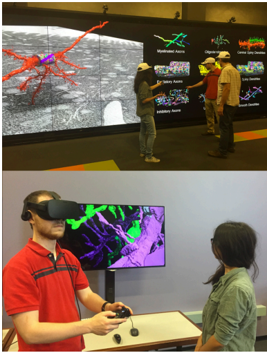
Figure 3. On the top we see researchers using a large-scale tiled display to explore models of neurons extracted from electron microscopy images. A subset of these models could be selected for further investigation using a virtual reality head mounted display available across the room. On the bottom, while one investigator explores the data in stereo 3D, others can see a non-stereo version displayed on a large monitor. In addition, each of the researchers in the view on top wears a hat, outfitted with tracking tokens that enables us to uniquely identify and track them. This information will be used as part of a separate effort to investigate how users interact in collaborative spaces such as these.

Leveraging the visualization cluster, which has large amounts of memory and multiple GPUs, several thousand of these complex models could be rendered at interactive rates and displayed on the tiled display. While this in itself could help provide insight, investigating these structures in further detail in stereoscopic 3D could prove to be even more beneficial. For this we use an Oculus Rift. A single workstation is used to drive the VR application, which limits the number of models that can be rendered at a time. Therefore only a subset of structures can be analyzed in further detail at a time. Researchers are able to utilize the tiled display to identify and select a subset of structures to transfer to the Oculus Rift for further investigation. Currently, this process has been done offline, but networking the two applications together and using Omicron would allow researchers to use a controller to select and transfer data from the tiled display to the Oculus in real-time (Figure 3).