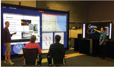
Figure 4. Collaborators gather in front of a large-scale display to share research findings and utilize a multi-touch digital whiteboard to brainstorm next steps to advance their work.

We have presented three authentic use cases that highlight how MDEs running separate, but often interconnected, applications enhance scientists' ability to explore, analyze, and disseminate their data. Future work includes analyzing motion capture data to investigate how users utilize the space within an MDE and how to further leverage additional display technologies, including augmented reality systems and mobile devices.