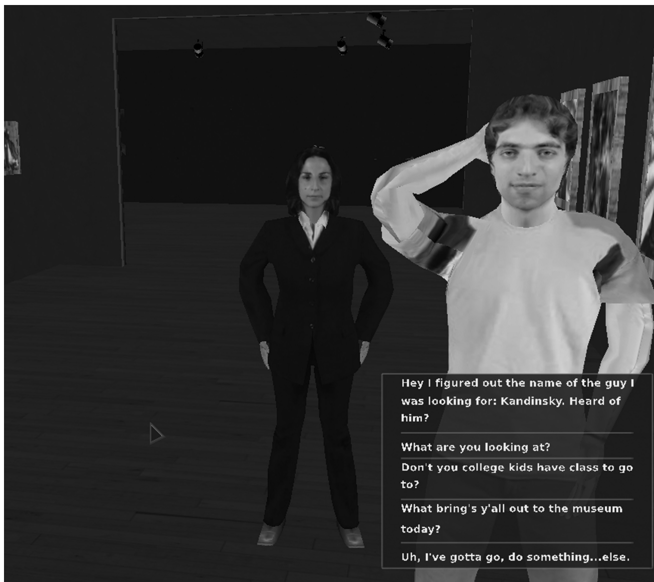
Fig. 5. Screenshot in the Modern/Postmodern room of a conversation with two students. The user can select any of the five comments/questions that are available in the current stratum of conversation.

the colors of the game were designed to be dark and bland, with the exception of the paintings, photos and reliefs in the museum galleries, which are colorful and high resolution.