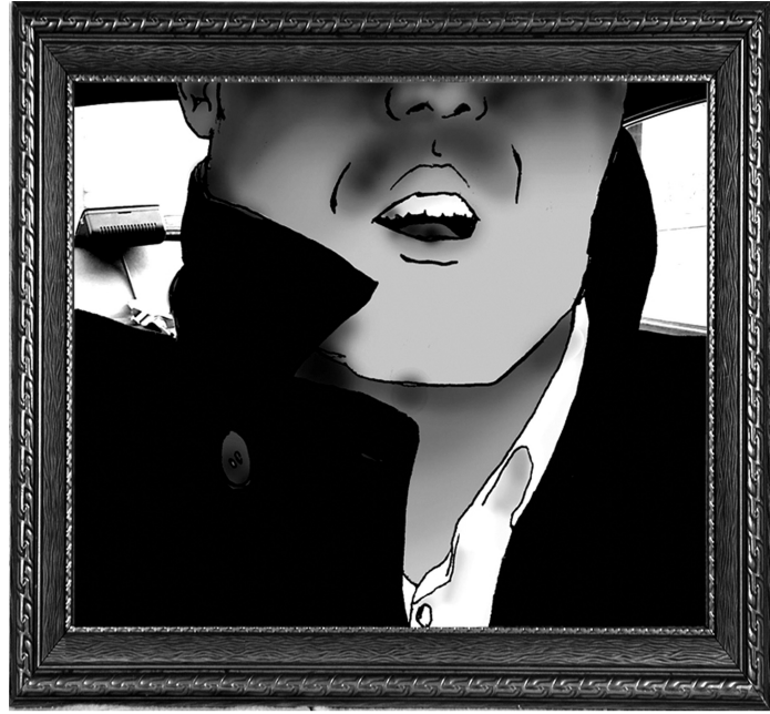
Fig. 2. Introductory narrative slide of a shadowy black market art dealer who coerces Wayne Kitsch to “steal the Kandinsky.” As Kitsch’s museum contains no wall labels, the user must communicate with museum patrons to discover which work Kandinsky created.