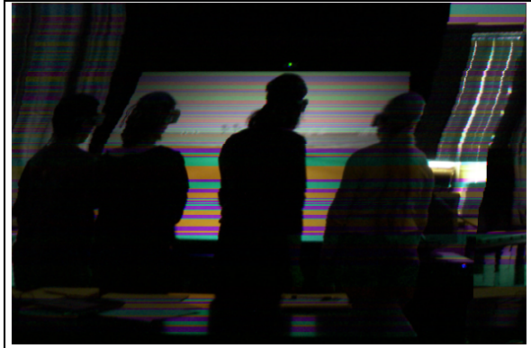
Figure 5: Photograph of four 6 th graders exploring one of the virtual ambient environments to collect data. Afterwards, they will then return to their classroom and integrate their data with the data of other groups