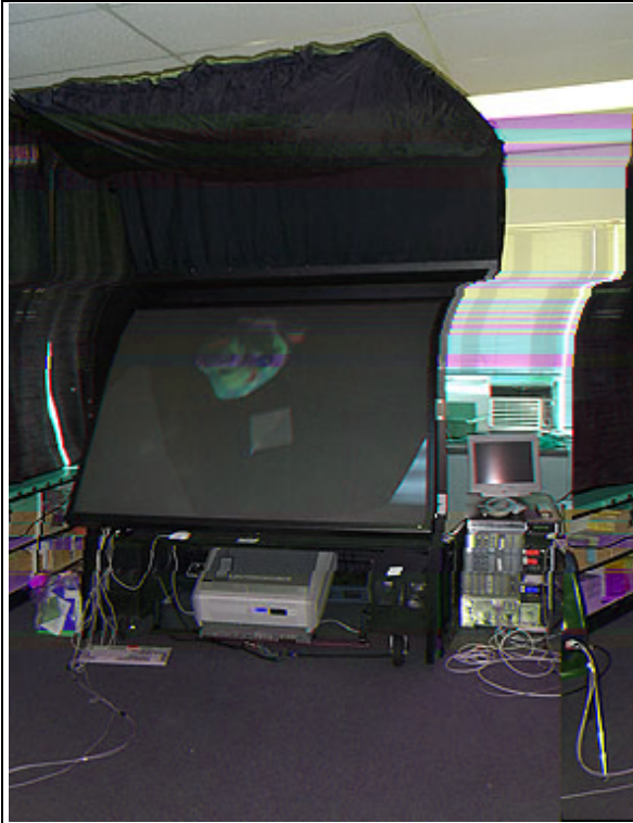
Figure 1: Photograph of the ImmersaDesk in a room next to the Media Center at Lincoln Elementary School

As such we are not limiting ourselves to slower, less powerful, less expensive equipment. We want to have high frame rates and detailed virtual worlds to give the technology the best chance of succeeding. This means throwing some very expensive technology at the problem to find what works and what doesn't. We want to find out which components of VR (wide field of view, head tracking, hand tracking, stereo visuals, audio, etc) are important in this endeavour, and how to leverage them effectively in the context of an elementary school.