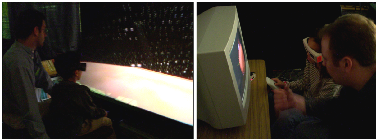
Figure 2: Photographs of two first grade students and their guides collaborating in the Round Earth project at Lincoln

The current equipment in the school consists of an ImmersaDesk driven by a 4-processor SGI deskside Onyx IR, and a 19" stereo monitor driven by a dual processor SGI Octane. While most of the work takes place at the ImmersaDesk, the Octane allows us to continue our work on collaborative virtual environments, and specifically those with heterogeneous views of the same space. It also provides a backup for the Onyx. See figure 1. We run both screens at 1024 x 768 in 96Hz stereo. Both computers are capable of sending audio to the ImmersaDesk's speakers. When we are conducting more formal learning studies we bring in recording equipment such as cameras and microphones.