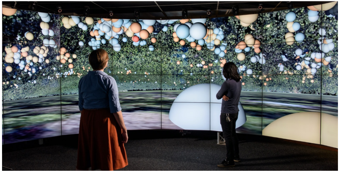
The SENSEI Panama ecology application will benefit from Composable Platform as a Service Instrument for Deep Learning & Visualization (COMPaaS DLV), which applies Deep Learning and Visualization to help anthropologists walk inside their data using virtual reality to study animal behavior. Data courtesy of UC Davis, visualized by EVL and displayed in EVL's CAVE2™.