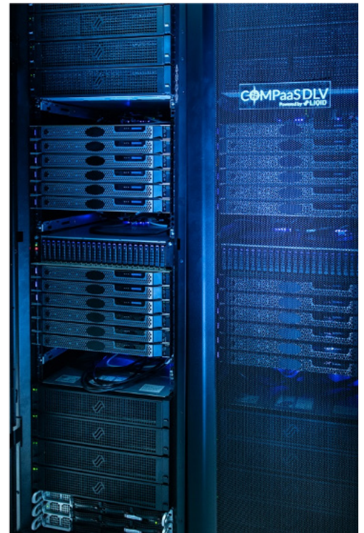
EVL’s COMPaS DLV system.

The design utilizes composable infrastructure architecture from Liqid. The computer’s components (traditional processor, GPU, storage, and networking) are pooled so that different applications with different workflows can be run simultaneously, with each configuring the resources it requires almost instantaneously, at any time.