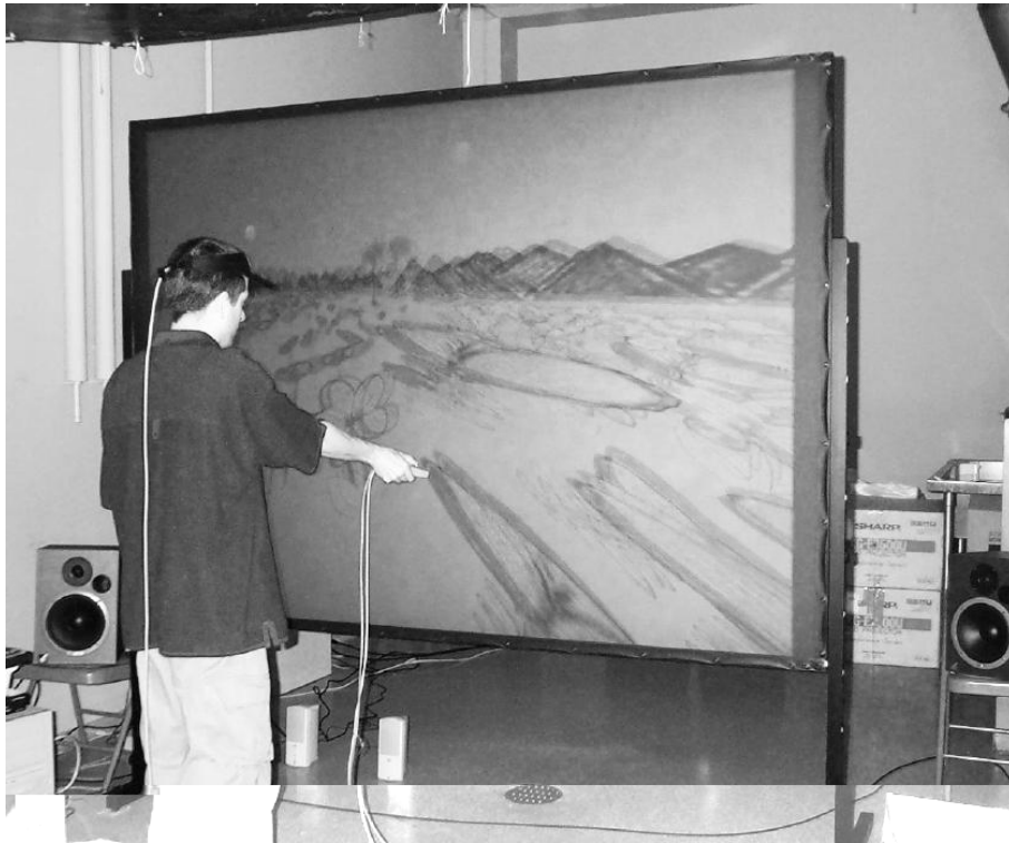
Figure 1: The system in operation

In addition to the cheaper projectors, polarized stereo glasses cost much less than the LCD shutter glasses used in active stereo. The polarized glasses are also less fragile, which is important in a museum or other public environment, where they will be subject to rougher handling than in a research lab.