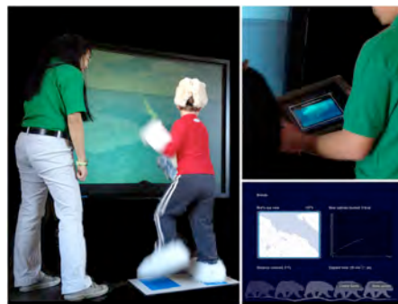
Figure 4. Create Your Own Mosaic at the Field Museum. Figure 5. Users experiencing A Mile in My Paws immersive environment.

A Mile In My Paws is an interactive 3D application designed to raise awareness of the affects of climate change for the Polar Bear population. It introduces zoo visitors to concepts of ice melting in the North Pole by giving them the opportunity to traverse and explore a visualized area of the Beaufort Sea – a terrain based on historical data, and on projections of ice coverage in the future. The main goal is to teach that the longer the polar bears swim, the more energy they consume for hunting. The navigation and interaction requires users' physical effort and embodiment to support learning. For swimming, users wear a pair of polar bear paws with an embedded iPod touch that sends the acceleration data to the system. For walking, users step on a step-pad with pressure sensors connected to the system. The virtual environment is complemented with an iPad application that displays real-time information related to users' performance and climate change facts. Our research looks at factors related to user experience, embodiment and learning outcomes about climate change. At this point we have done formative studies