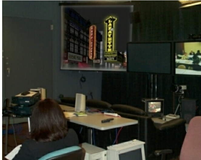
Figure 4. The AGAVE system allows us to bring Virtual Harlem into the classroom using passive polarized stereo visuals driven by a Linux PC. The screen on the right shows a video conference with the remote classroom.

their two dimensional Access Grid content – the Access Grid was designed primarily for multi-site video conferencing. With AGAVE, students wear inexpensive ($0.30 to $12) 3D movie glasses to view the immersive content. If desired an additional 3D tracking system and pointing device can be incorporated to support 3D interaction. In this study we used a regular joystick. Figure 4 shows Virtual Harlem running on AGAVE. To the right of the AGAVE are plasma display screens of the Access Grid. On the rightmost screen is a video stream from the classroom at CMSU.