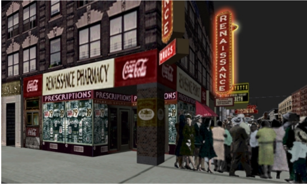
Figure 1. Virtual Harlem allows students to walk through the streets of Harlem in the 20s and learn more about the context of the literature they are studying.

Harlem in an English literature course. The goal of the broader study was to explore how VR could be used to enhance traditional learning technologies such as books, videotapes, CDs etc, in the classroom. In the interest of brevity, this paper will focus only on the students' experiences with Virtual Harlem.