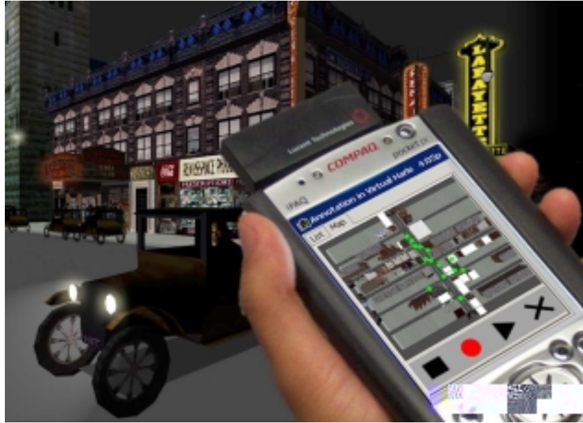
Figure 3. Using the PocketPC interface the user can see all of the annotations in the space. The list view shows who made the annotation and when it was made. The map view shows the locations of all the annotations.

environment by specifying a database file. The tool records the user's gesture and voice into separate files with headers that include the author's name, the annotation's name, and the location of the annotation in the virtual environment. Thus, it allows users to query the list of annotations by the author's name, region, or date.