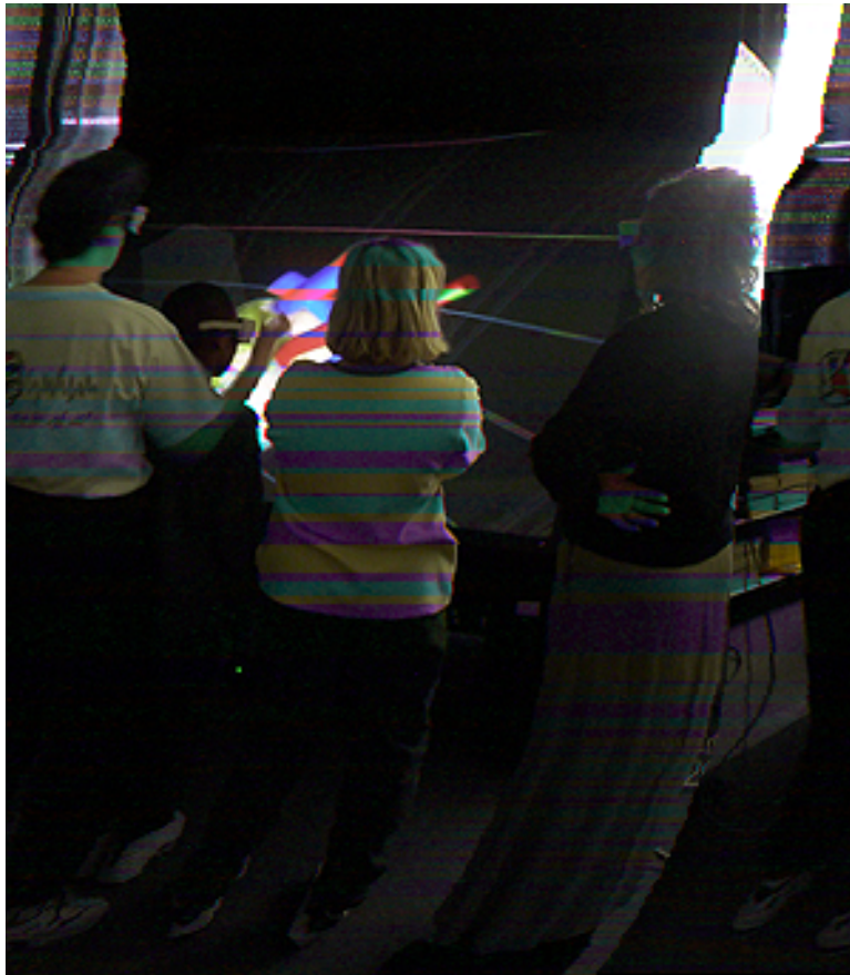
Figure 2: Kathy Madura, PE teacher, discussing the human heart with her students using the ImmersaDesk at Lincoln

A typical pattern of usage can be seen in a recent experience with the heart model. The physical education teacher had previously used "Heartland," a model of the human heart realized as a collection of kid-sized carts, pulleys, balls, hoops, and tunnels laid out on a gymnasium floor. The kids wheeled about on the carts, picking up corpuscles, and moving from one chamber to another.