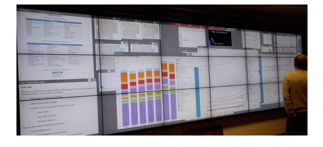
Figure 1: A subject examining crime data.

Subjects were instructed to ask spoken questions directly to the DAE (they knew the DAE was human, but couldn't make direct contact<sup>4</sup>). Users viewed visualizations and limited communications from the DAE on a large, tiled-display wall. This environment allowed analysis across many different types of visualizations (heat maps, charts, line graphs) at once (see Figure 1).