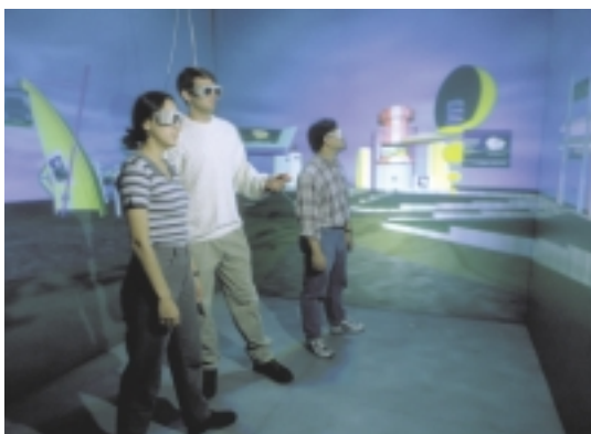
Figure 1. The CAVE (Cave Automated Virtual Environment). CRT projectors project stereoscopic computer images onto the CAVE's translucent walls, giving the occupant (user), who is wearing special glasses, the illusion that objects surround him. The user interacts with the environment through a wand (not shown).

images. The images give the CAVE occupants, or users (there can be up to 10 users), the illusion that objects surround them. Users don lightweight liquid crystal shutter glasses to resolve the stereoscopic imagery and hold a three-button wand for 3D interaction with the virtual environment. An electromagnetic tracking system attached to the glasses and the wand lets the CAVE determine the location and orientation of the user's head and hand at any given moment. This information instructs the Silicon Graphics Onyx that drives the CAVE to render the images from the user's point of view.