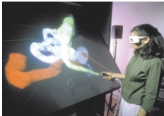
Figure 6. The Virtual Temporal Bone. Three users discuss the structure of the inner ear using pointers to identify and move its various components. The Virtual Temporal Bone makes it much easier to see the spatial layout of the inner ear structures, compared with the flat images in medical texts.

simultaneously. They can critique the design and suggest changes to the designer, who can make them immediately at the CAD workstation.