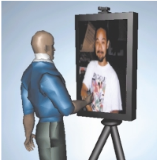
Figure 4. The AccessBot teleconferencing device. The remotely controllable pan-tilt-zoom camera mounted above the plasma display lets users look around the meeting room. AccessBot gives the remote user an equal presence with local meeting participants.

PARIS is the first VR display system prototyped in VR before it was physically constructed. We wrote a PARIS simulation to run in the CAVE so that a designer can sit in the CAVE and observe the effects of the mirror's tilt angle on image placement. Past work in developing VR displays was based solely on mathematical models, which do not take into account user preferences and application-specific requirements. For example, a particular screen angle may be suitable when the user must navigate through a space, but another angle may be better when he must directly manipulate small virtual objects.