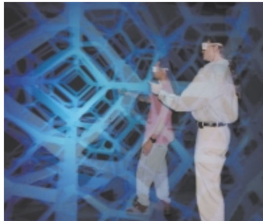
Figure 8. The Teleimmersive Data Explorer. TIDE lets collaborators explore terascale data sets. Here, TIDE is compressing a sponge lattice, which it generated from a super-computer simulation involving terabytes of data.