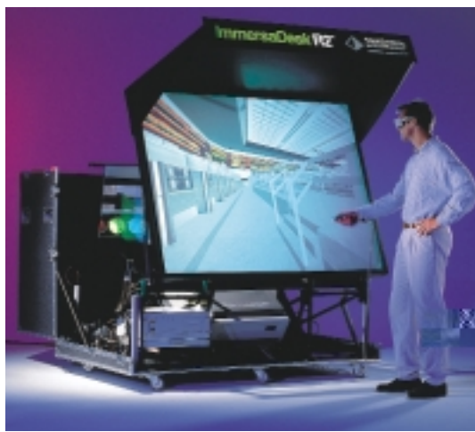
Figure 2. The ImmersaDesk. Like the CAVE, the ImmersaDesk projects stereoscopic images, but it is designed for images on a desktop scale, such as CAD models.

The EVL is continuing its efforts to develop display technologies, aiming for more compact devices that