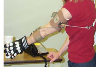
Fig. 2. the BPO. A zipper sewn into the palmar side of the glove facilitates donning.

flexion pull on the cables, thereby forcing the fingers to extend. This single control moves all fingers simultaneously in a manner akin to that of control of the prehensor in arm prostheses. Alternatively, the cable can be run to a handle held by the unimpaired hand; extension of the unimpaired arm extends the fingers on the impaired side. In either manner, the user controls the amount of assistance provided to finger extension. The cable housing over the MCP and PIP joints also serves to prevent hyperextension of these joints.