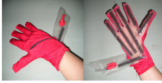
Fig. 3: Picture of the glove that contains the bladder on the palm of the hand. The electro-goniometers are attached with Velcro to the volar surface of the glove over the PIP and MCP joints.

joint angles are compared with the desired trajectories necessary for opening the hand sufficiently to grasp the object.